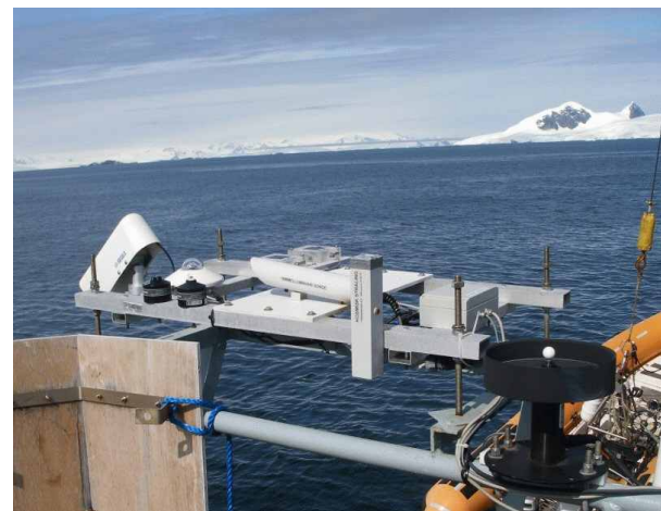
Figure 2: Two SolData pyranometers performed measurements during the Danish Galathea 3 Expedition 2006-07 here shown near the Palmer Peninsula.

SolData pyranometers are used to measure solar irradiance from as far north at Thule in northern Greenland to the Palmer peninsula in Antarctica.