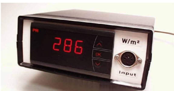
Figure 5: Continuous display of irradiance in W/m^2 can be achieved using a SolData DM-PYR. Options include relays and a 0-20mA current loop output signal.