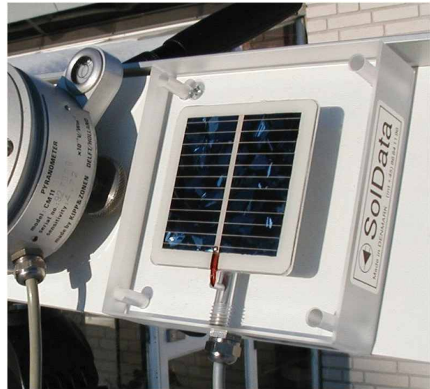
Figure 1: The SolData 80spc pyranometer is supplied with a 3 meter long cable and a weather-proof IP54 connection to the instrument.

Experience has shown that cable length is non-critical, and cable lengths of up to 30 meters can be used successfully. Atmospheric disturbances such as lightning can of course affect measurements, so it is wise to protect long cables from exposure by burial or by running cables indoors. Shielded cable is not essential unless a high electrical noise environment is anticipated. Connect the end of the 3 meter cable supplied directly to your datalogger or connect it via an extension using a weather-proof electrical housing.